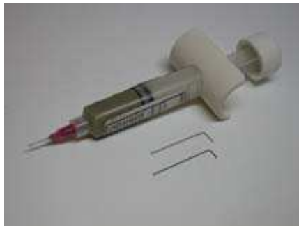
Solder Aid $5.95

1 .25 inch diameter x .010 inch, 114 tooth high speed steel blade.