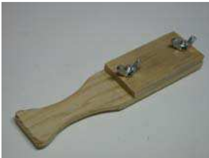
Wire Guide $5.95

Finger & hand grip for aiding squeezing solder from \frac{3}{4} in. diameter (approx.) paste solder syringes. Includes clean out wires for 16 and 20 gauge needles. Shown installed on a syringe.