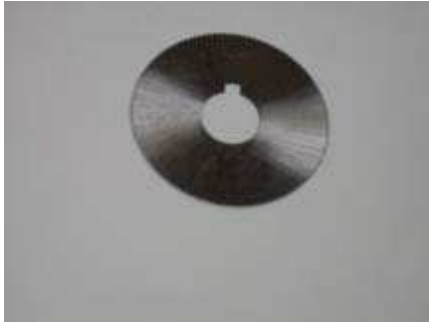
Replacement Cutter Blade $9.95

Gemstones Etc. 3649 N. Pellegrino Drive Tucson AZ 85749 520-749-2413 E-mail: gemstonesetc@gainbroadband.com