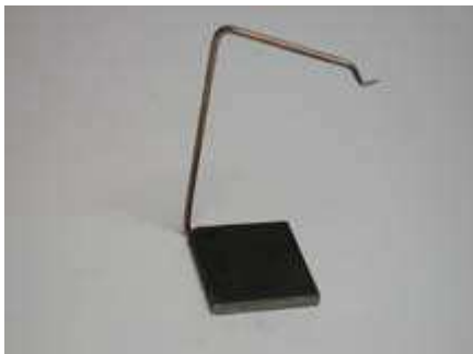
Soldering Stand $5.95

A 1 1/2 x 6 inch guide that facilitates keeping wire shapes other than round from twisting when winding into coils.